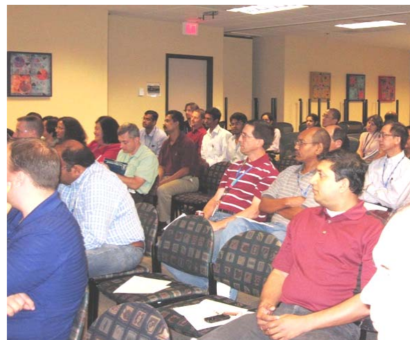
Over 50 employees attended the session.